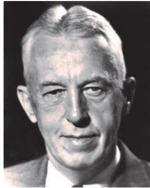
William G. 'Bill' Wilson b. November 26, 1895. d. January 24, 1971 Co-Founder of Alcoholics Anonymous

Bill was under hospital care for acute emphysema and was unable for the first time to attend the A.A. banquet at which his "last drink anniversary" had been celebrated annually. His greetings were delivered by his wife Lois to the 2,200 A.A. members and guests at the New York Hilton.